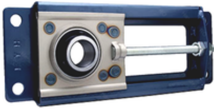
FYH SBNPTH205-100 Bearing unit